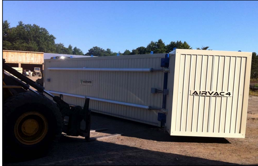
Figure 3. The AirVac 4 kiln before installation.

The new kiln is smaller than its predecessor with a 5' × 25' footprint and 5' in height. The mechanics of the vacuum kiln vary slightly from the traditional kiln. Heat can be provided by a variety of sources as either hot water or steam, since the heating requirements are so low – approximately 180°F and 200,000 Btu/hr for the proposed model. Like its predecessor, the vacuum kiln has air circulation fans – a total of four at 5 hp each to ensure that the wood dries evenly. In addition, a 7.5 hp vacuum pump is used to maintain the partial vacuum in the kiln. Finally, two ½ hp condenser fans allow the moisture in the air to be condensed and expelled from the kiln. The kiln construction involves an airtight seal to prevent infiltration. The tight control of interior conditions reduces the likelihood of checking of the wood, reducing the product that needs to be discarded.