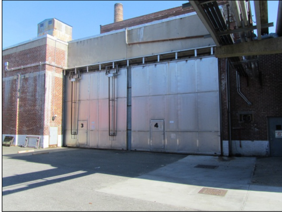
Figure 1. Kilns #3 and #4 at Steinway & Sons.

The kilns are controlled for both temperature and humidity throughout the drying process, which is complicated and involves several steps. The objective is to reduce the amount of moisture in the material to a specific level over a period of time. In order to achieve the desired moisture content, and at the right speed, a mix of dry heat (provided by a steam coil), live steam injection, and ventilation is required. The process involves a repeating series of stages, as follows: